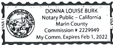
Place Notary Seal and/or Stamp Above

Signature [Handwritten Signature] Signature of Notary Public